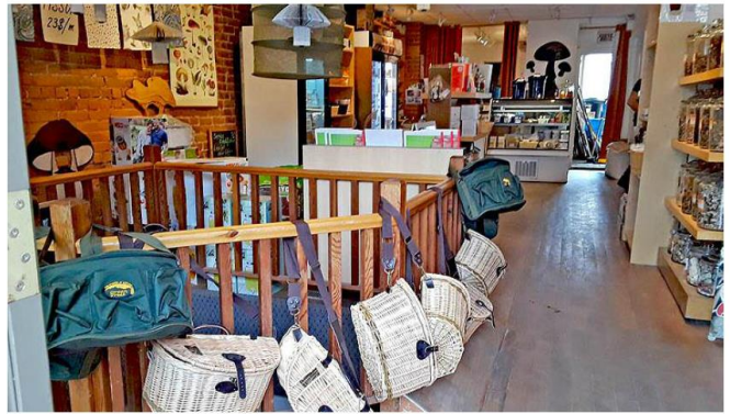
The view of the Myco Boutique upon entering