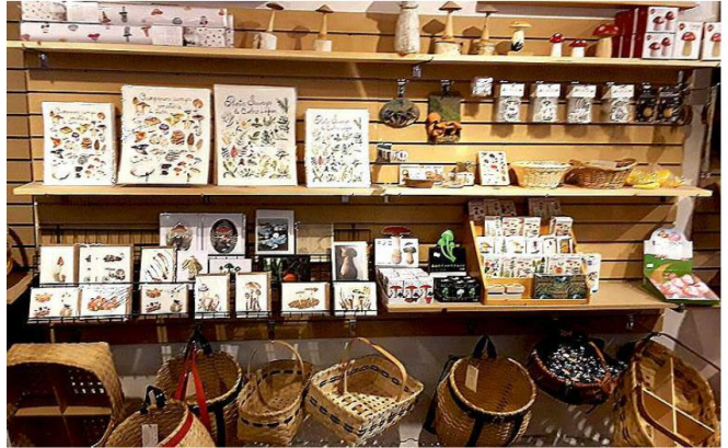
Shelves loaded with myco-goodies